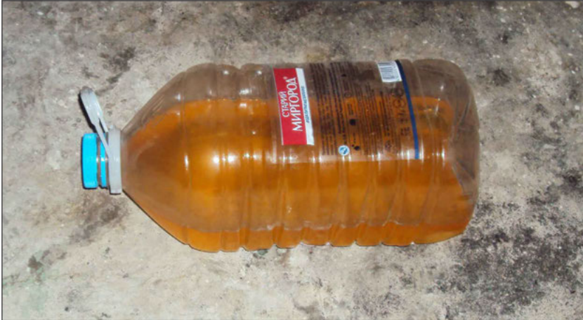
A bottle filled with urine. A typical toilet for the detainees. Former illegal place of detention at the bomb shelter of PrJSC "Lysychansk Glass Factory Proletariy"