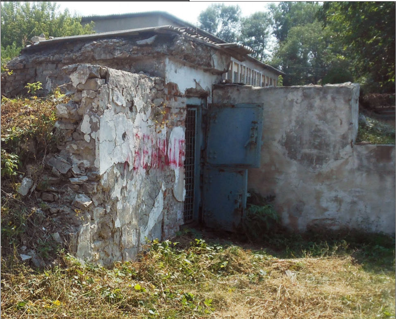
Bomb shelter on the territory of PJSC “Lysychansk Proletariy Glass Factory,” 1 Michurina str., Lysychansk

GBV was a component of torture and ill-treatment experienced by women held in detention. For instance, in two cases the offenders drilled woman’s breasts with screwdrivers.